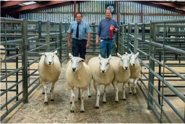
Fort King 6000 gns