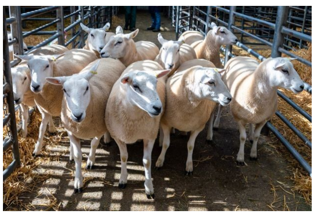
Steen Shearlings to £230